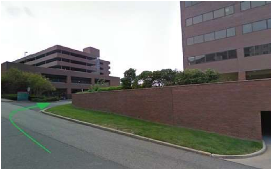
Our Entrance --- parking lot/garage