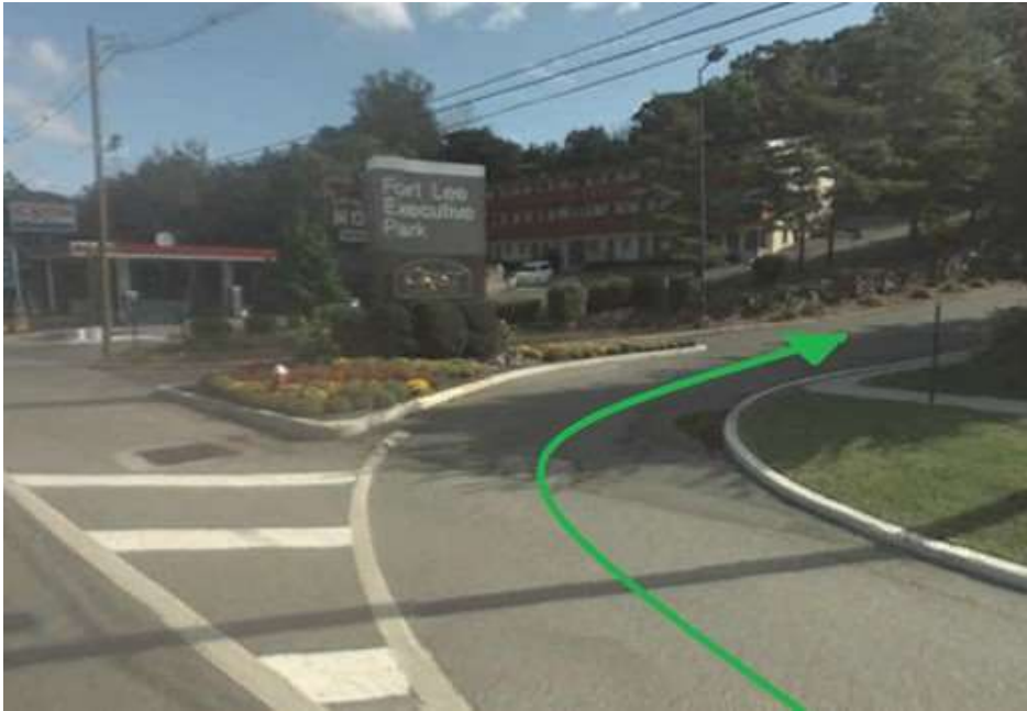
Our Exit off Route 4

East- Fort Lee NY/ NJ Two Executive Dr, 2nd Floor Fort Lee New Jersey 07024 201.585.8200